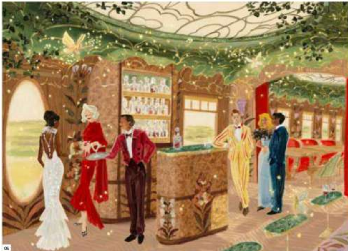
04 An era-defining chapter for the British Pullman — intimate, theatrical, and unapologetically decorative.