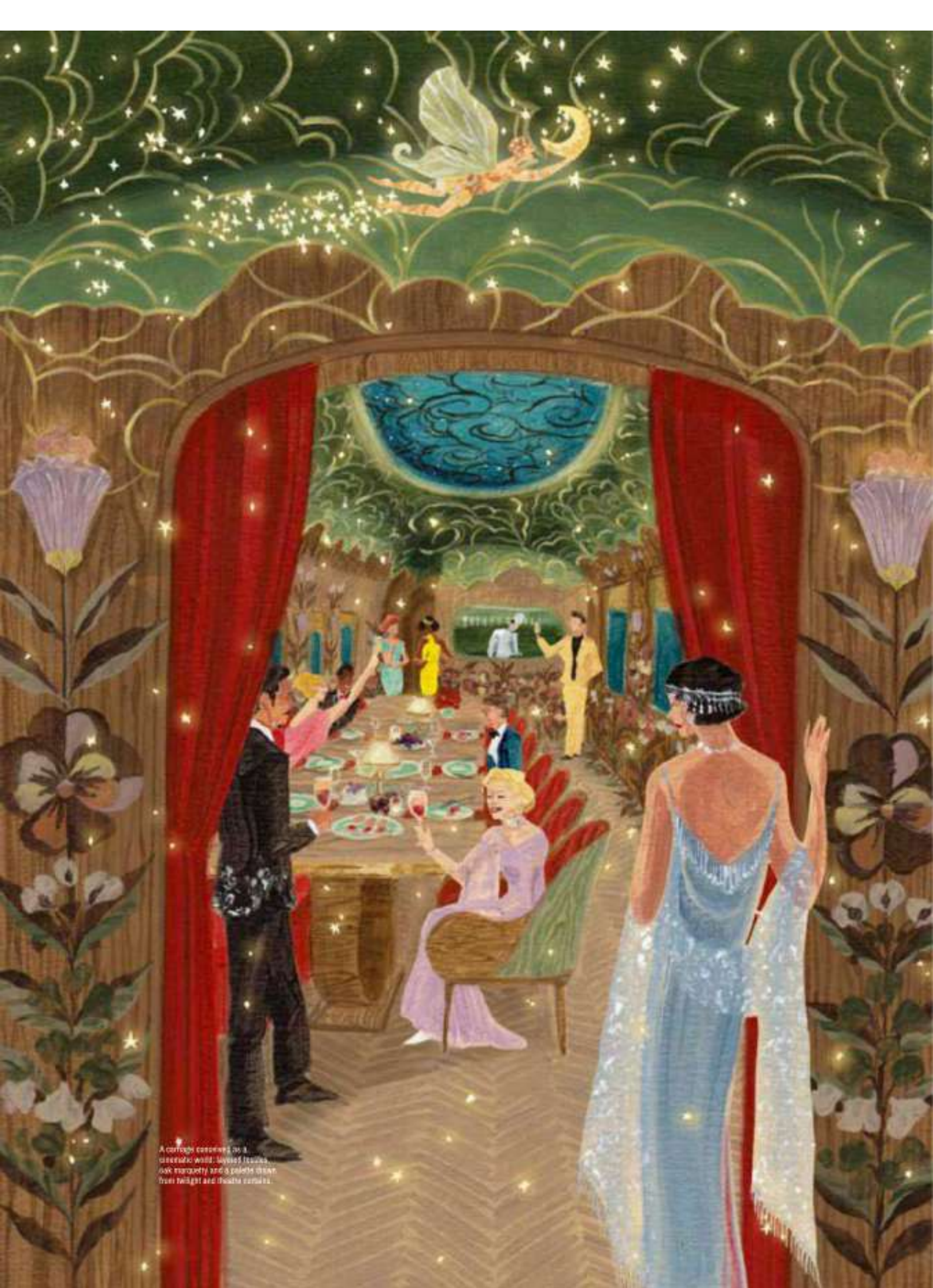
A carriage ceiling as a mosaic; wall-lounged tables, oak marquetry and a palette drawn from twilight and theatre curtains.